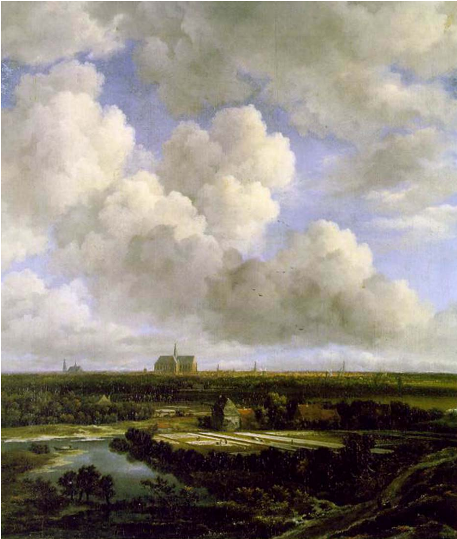
Fig. 4: Jacob van Ruisdael: "View of Haarlem with Bleaching Grounds", (Canvas, 62 x 55 cm, c. 1670/75, Kunsthau Zürich , Ruzicka-Stiftung, Inv.Nr. R32)

cloud at the left rim of the picture, are tilted slightly to the right, i.e. to the west which indicates an increase of wind speed with height (wind shear). This is in accordance with the assumed wind direction from southeast.