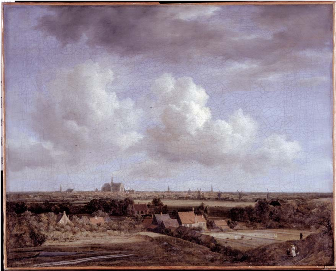
Fig. 1: Jacob van Ruisdael: "Haarlem seen from the Dunes near Overveen" , (canvas, 52 x 65 cm, c. 1670, SMB, Painting Gallery Berlin , Cat.Nr. 885C)

Meteorologically this scene can be explained as follows: in the course of the night a cold front passed over Holland from the northwest with showers and thunderstorms pushing away an advancing warm air mass. Near the rear of the front some cirrus clouds as well as a few midlevel altocumuli can be observed. The fresh maritime polar air mass will soon come under further high pressure, but here, close to the cold front, the air is still unstable enough to create medium and tall cumulus clouds. Now, in the late afternoon, some of these clouds have already decayed and their remnants can be seen at the upper rim of the painting. The wind direction has changed from southwest to northwest as two of the seven windmills have their sails still facing to southwest while the other, active mills have turned their sails into the now prevailing wind direction.