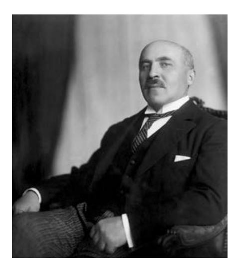
Figure 4. Nándor Bernolák in the 1920s.

The numerus clausus was above all a product of this mentality. It was an anti-Jewish law, which—after 1920—punished Hungarian Jewry as a group, without individual considerations, for the losses which Hungary had suffered as a result of the war, the revolutions, and the peace treaty. The racial quota of the numerus clausus was thus linked with the post-revolutionary anti-leftist political cleanup: the same clause that institutionalized