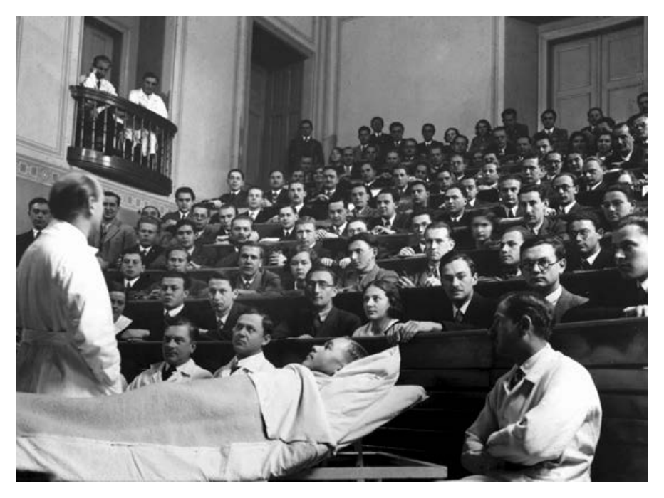
Figure 21. The lecture hall of the clinic of the Royal Hungarian Elizabeth University (University of Pécs) in 1928.

ceutical and mathematics faculties of the University of Szeged or at the Faculty of Medicine in Pécs and the Faculty of Law in Debrecen. At the same time, the proportion of Jews rejected from the medical faculties of all three universities exceeded 80 percent. Almost all Christian applicants were accepted at the University of Technology, the pharmaceutical faculties of the universities of Budapest and Szeged, and the faculties of humanities at the universities of Debrecen and Pécs. Jewish applicants were rejected in high numbers—above 70 percent—at the law faculties of the universities of Pécs and Szeged and at the University of Technology. There were courses, for example, the mathematics or pharmaceutical sciences at Szeged, where—once all the Christian applicants had been accepted—they also accepted 50–70 percent of the Jewish applicants, though these were smaller courses.