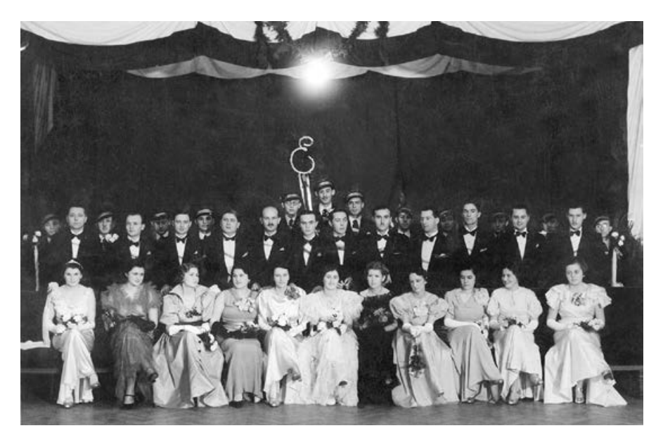
Figure 13. Ball of the Foederatio Emericana (association of Catholic Hungarian university and college students), 1935. Source: Fortepan, 101583, Miklós Pápay.

street protests right up to the moment parliament passed the anti-Jewish law.<sup>149</sup> They prevented Jewish students from entering the universities and checked the papers of students in the corridors, ejecting those who were Jewish. They did not allow Jewish students to sit for their exams. It was enough for someone to merely look Jewish to fall under suspicion. In October 1919, the government closed the universities because of the anti-Semitic incidents and teaching only resumed the following spring.