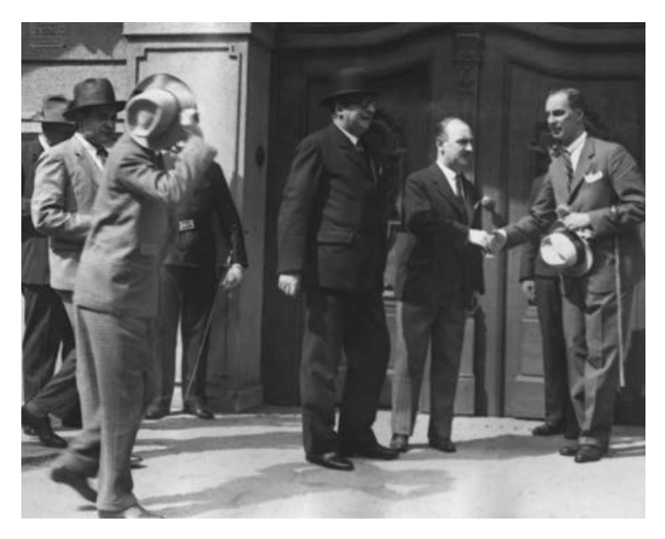
Figure 2. Minister of Religion and Public Education Kunó Klebelsberg (in center).

Despite using this apologia in international fora for diplomatic ends, not even Klebelsberg himself believed it. "I never associated myself with this law," he told the press in 1927. "I merely inherited it." This led to the accusation that he changed his opinions to suit his audience.<sup>40</sup> As for the theory about the surplus of graduates, he considered it simple demagoguery. As he said in parliament: "Unfortunately in Hungary, one can achieve absolutely anything with catchy phrases. The talk of a surplus of intellectual proletarians is just such a phrase, which may have dangerous consequences. . . . School is school, you can't make a socio-political or economic question out of it."<sup>41</sup> In reality, Klebelsberg thought that preventing a surplus of university graduates through state intervention was a downright "impossibility," which in the long run could have the decidedly harmful effect of excluding the children of the Christian middle class from the universities. "They've whined so much to me about the rampant intellectual proletariat that in the end I had to show them the impossibility of these demands."<sup>42</sup> Klebelsberg viewed state intervention to suppress the expan-