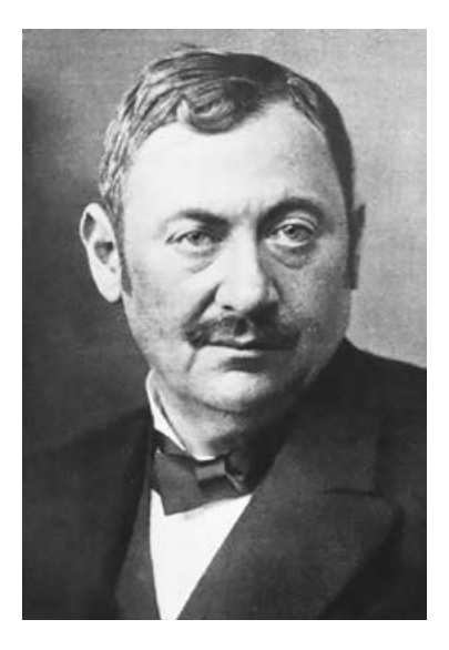
Figure 18. Vilmos Vázsonyi.

Vázsonyi's declaration was at the same time a stand against the Treaty of Trianon. Since the Jews were part of a common Hungarian nation, they could have no inter-