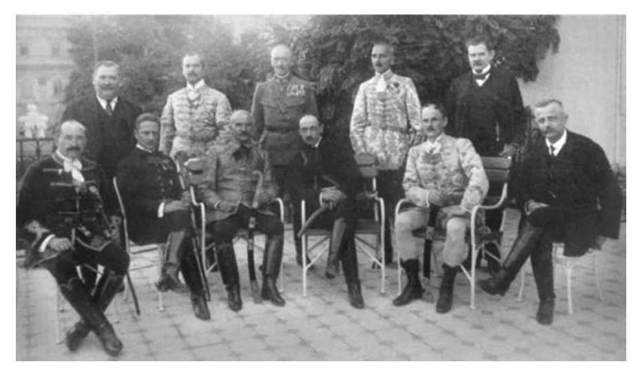
Figure 7. Picture of the first Teleki government (July 1920–April 1921), with Prime Minister Pál Teleki (sitting in the middle, third from the right) and Minister of Religion and Public Education István Haller (sitting first from the left).

At the moment we must pay careful attention in all our actions to certain considerations that we may be able to ignore sometime in the future, but which at the moment ... represent a danger for us.... It was for this very reason that I did not consider a hasty solution and final settlement of this question to be opportune, and tried to persuade those concerned to seek a solution which would achieve the end itself, but which would be unassailable and for which the country and the nation would not face any difficulties anywhere.<sup>70</sup>