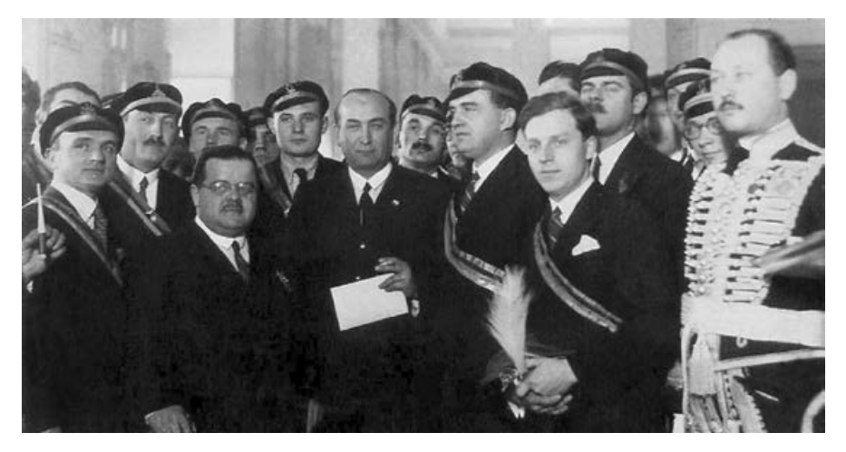
Figure 5. Prime Minister Gyula Gömbös (center) with the leaders of the Turul Alliance in 1933.

cent of the raw materials and also limiting the proportion of Jews employed by the ministries that distributed raw materials to 8 percent.<sup>3</sup> Additionally, a proposal was made to introduce a quota in the press, with printing paper distributed according to the proportion of the various "nationalities," and Jewishowned newspapers marked with some Hebrew letters.<sup>4</sup> Another proposal was to extend the Jewish quota to secondary schools,<sup>5</sup> while yet another to exclude Jews from state tenders. In addition to these economic sanctions, one proposal also sought the introduction of the so-called "racial defense" laws, which would exclude Jews from teaching subjects that were part of forming the "national and Christian spirit" and would ban Christians from domestic service in Jewish households. Jews would also be excluded from public service and have their political rights revoked.<sup>6</sup>