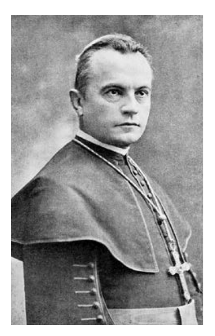
Figure 9. Bishop Ottokár Prohászka.

Jews in the country overall. This includes data on bankers, landowners, businessmen, engineers, doctors, lawyers, and students at universities and polytechnics. These, then, are the fields in which the proportion of Jews will have to be measured using statistical data. And from this data will have to be made that "whip" which will help to change the inner balance of economic life.