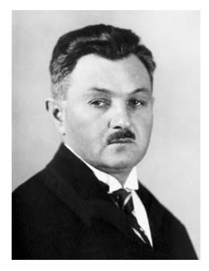
Figure 17. Rezső Rupert around 1928.

others frequently noted that the measure was also intended to prevent the formation of an "intellectual proletariat," and thus the number of Christian students also had to be kept in check. This idea was, however, unrealistic for a number of reasons.