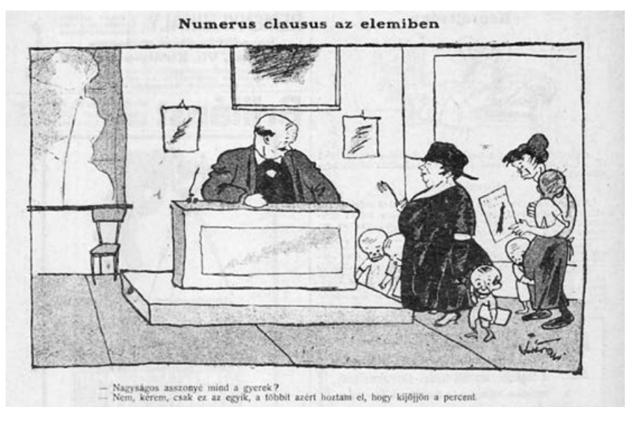
Figure 3. Caricature in the satirical Borsszem Jankó entitled "Numerus clausus in the elementary school." Caption reads: "Do all the children belong to Madame? — No, please, just this one, I brought the rest so that the percentage would work out." Borsszem Jankó , no. 29 (1920): 12.

paigning for the numerus clausus referred to the everyday perception that Jews were disproportionately well-represented in white collar jobs, their arguments would more often have led logically to a call for a numerus clausus not in the universities, but in the secondary schools.