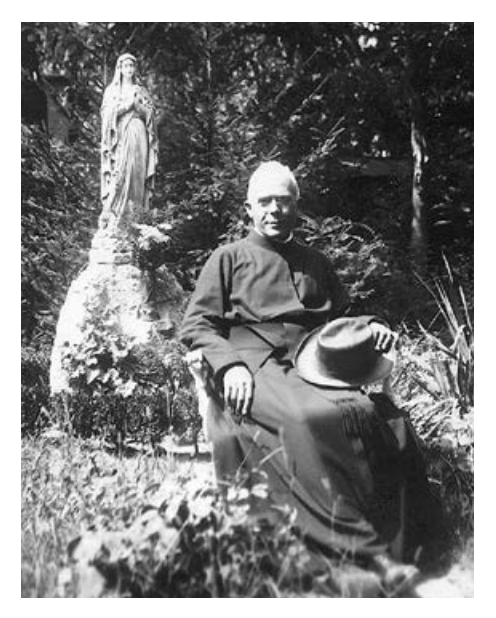
Figure 10. The Jesuit theologian and journalist Béla Bangha.

cess involved the restriction of the rights of the Jews and indeed could lead to their persecution.