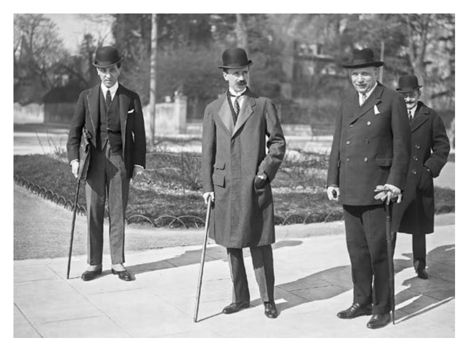
Figure 14. Prime Minister István Bethlen (center) with Minister of Foreign Affairs Lajos Walkó (second from right) in Geneva, 1926.

political life in its ability to solve problems. We have no record, however, of any moral objections to the Jewish quota on his part. What is known is his opinion that the numerus clausus was a tool that could help weaken the position of the Jews in Hungary until the members of the non-Jewish middle class, who "represent the appropriate race in historical tradition . . . will lead the nation once again."<sup>176</sup> At any rate, it is a fact that Bethlen—while he increasingly distanced his government from political anti-Semitism throughout the 1920s—waited until after the League of Nations started proceedings against Hungary before repealing the racial clause. When he did amend the law in 1928, he approved his minister of education's recommendations which served to perpetuate the exclusion of the Jews, albeit no longer on a racial basis but through express quotas on certain professions.