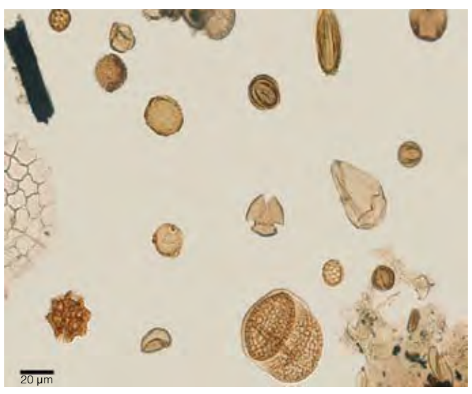
Figure 4. Typical glacial pollen spectrum from the new core (Sample is from a core depth of 10.0 m, corresponding to Marine Isotope Stage 3).

correlative to the Campanian Ignimbrite and Y-5 in the Mediterranean Sea, having a <sup>40</sup>Ar/<sup>39</sup>Ar age of ~37 kyr BP (S. Wulf, 2006, pers. comm.).