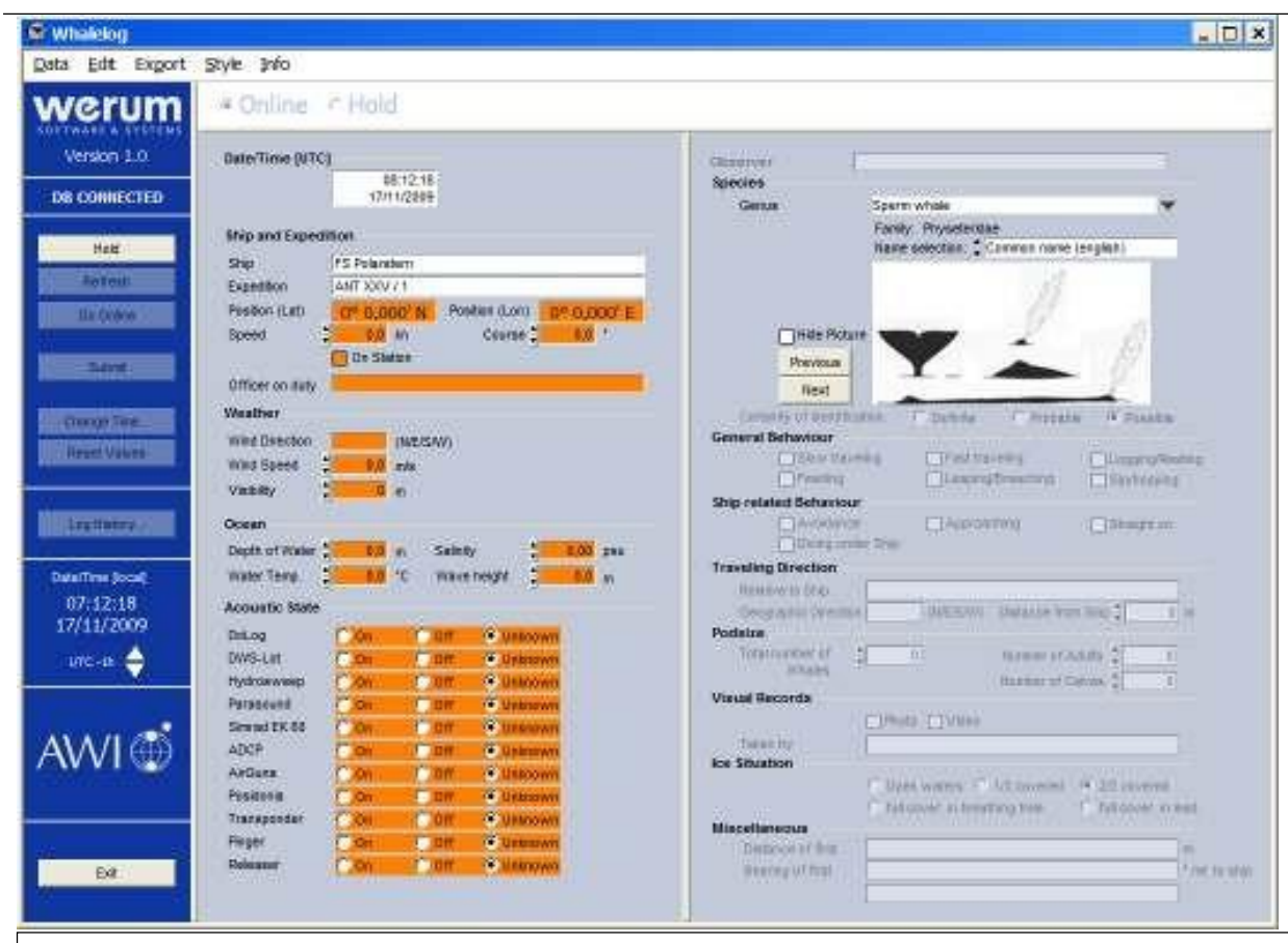
Figure 2: Screenshot of Werum Wallog program for systematic recording of opportunistic cetacean sightings in use for ANT XXV.